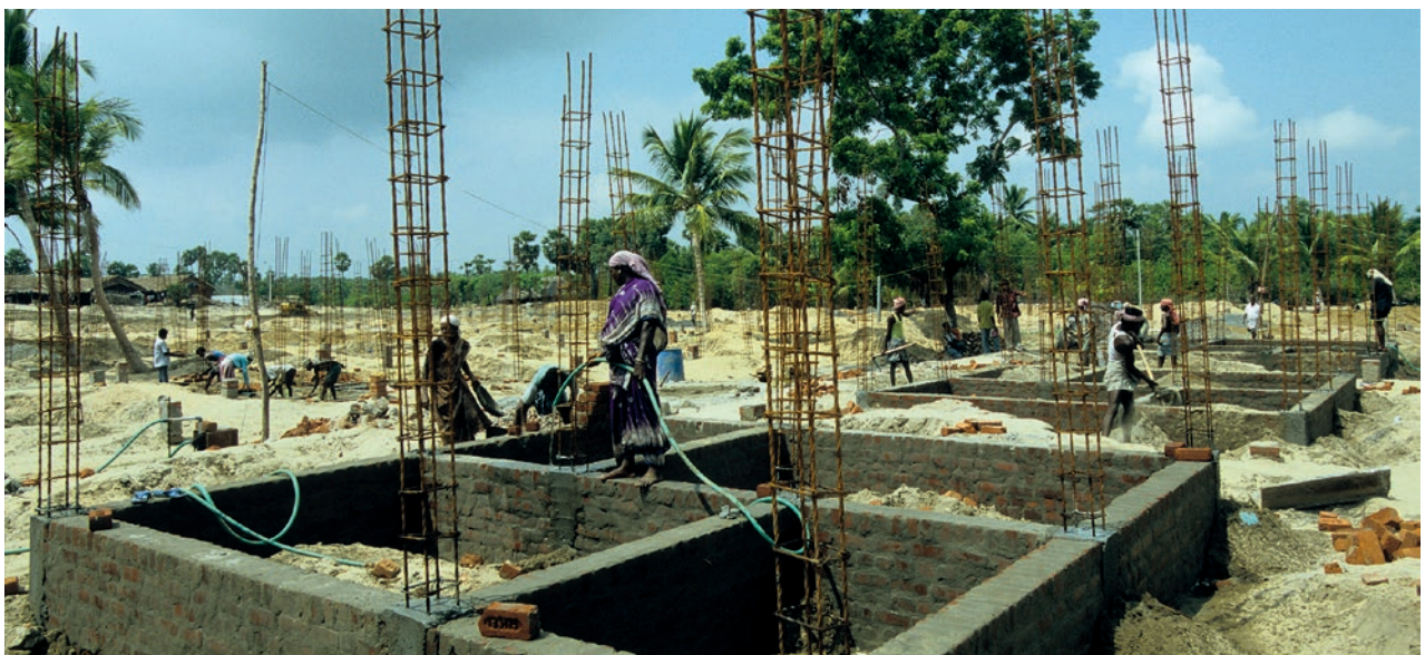
House building program after the Tsunami wave in a small village in Vilundamavadi, India. During crisis and its aftermath, development banks can play a positive counter-cyclical role and help to promote recovery of the whole economy.

Last but not least, a final, but very important point needs to be stressed again here. This is the need for "good" development banks. Further research is required on this topic, both in terms of evaluating rigorously past experiences of existing development banks, as well as defining "best practice" for good development banks.