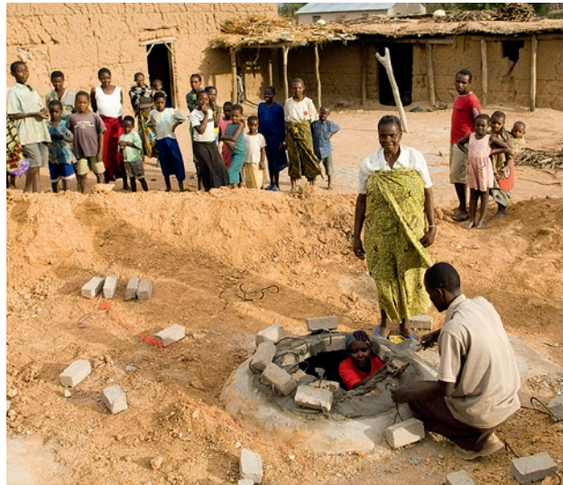
A biogas energy programme in Mvumi, Tanzania. Development banks can play an important role in funding investments in renewable energy – thus supporting structural transformation to a sustainable development path.

Griffith-Jones and Gottschalk (2012) provide empirical evidence of the clear counter-cyclical role played by multilateral and regional development banks in the aftermath of the 2007/8 financial crisis (see more details below). There is also a growing body of detailed empirical evidence that national public banks, including national development banks, provide counter-cyclical finance (these national public banks include not only national development banks, but also government-owned national savings or commercial banks, thus are a broader category than public development banks). Brei and Schlarek (2012a) and (2012b) compare the lending responses across national public and private banks to financial crises using balance sheet information for about 560 major banks from 52 countries during the period 1994 to 2009. They find evidence that the growth rate of lending during normal times is higher for the average private bank compared to the average public bank. During financial crises, however, private banks’ growth rate of lending decreases while that of public banks increases. These results indicate that public banks have played a counter-cyclical role in their banking systems, while private banks behaved pro-cyclically. They offer two important explanations for this. Firstly, the