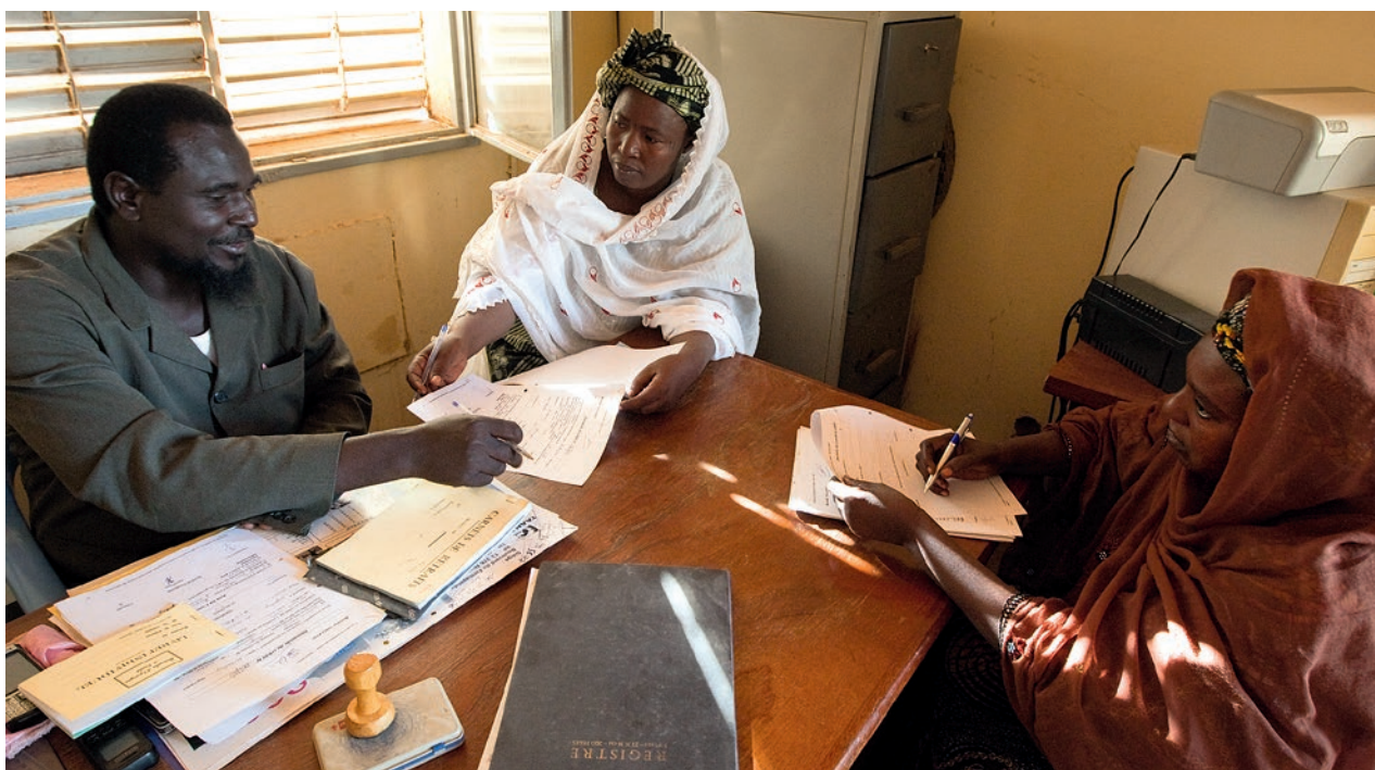
Development banks can help channel sufficiently low cost credit to small and medium enterprises. For a development bank to be “well-run”, it must keep narrow private and political vested interests outside of its decision-making process, thus avoiding corruption. Its hiring of staff should be transparent, and based on merit, and it must consult with people, who could be potentially negatively affected. Here a credit committee in Niamey, Niger in Africa.

bonds from different developing and emerging economies, and sell them in the capital markets, where they would benefit from benefits of diversification.