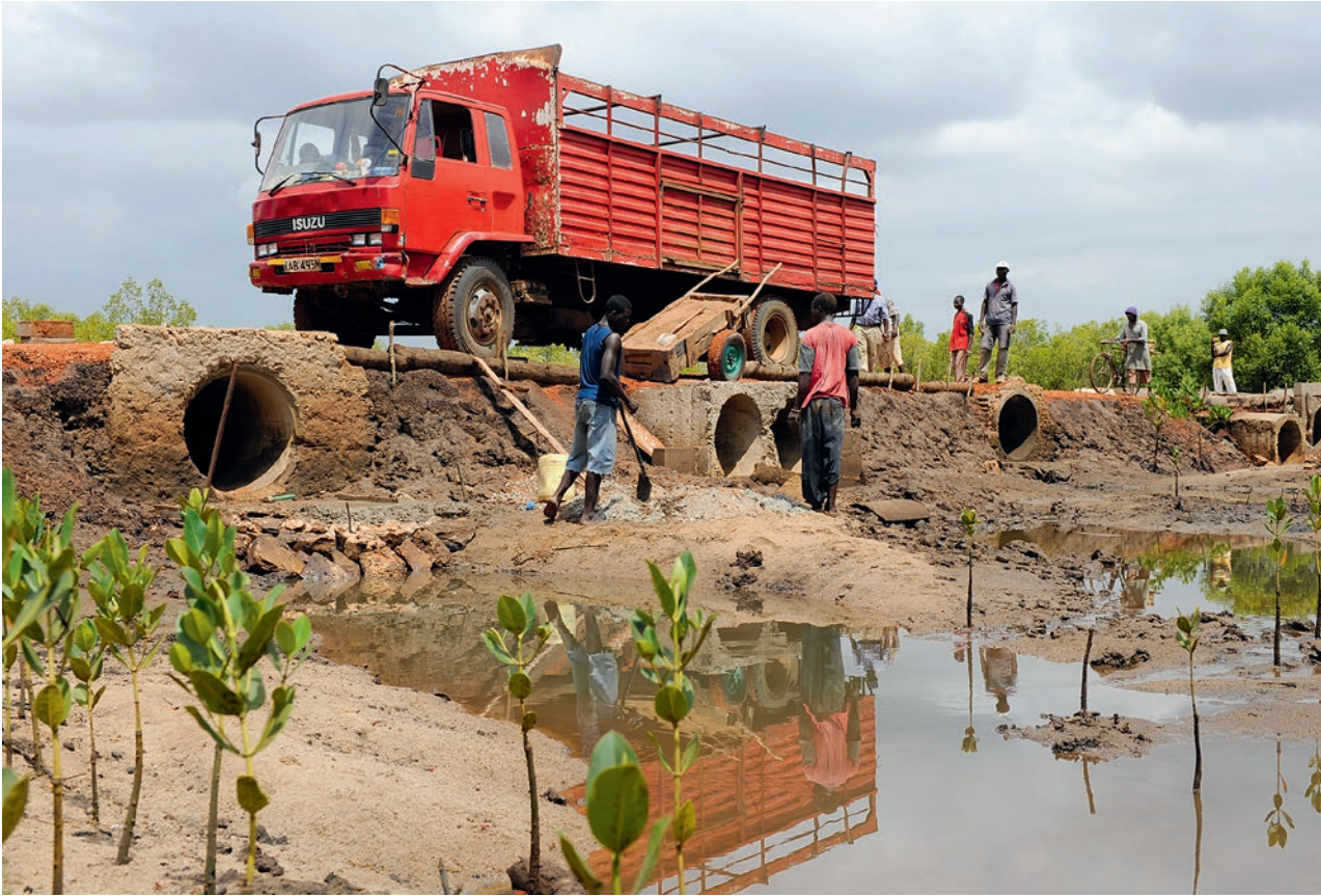
Well-run development banks can ensure long-term finance for key development sectors and sustainable infrastructure like building roads to connect small and remote villages and enable their market access. Here the construction of a road between villages near Mombasa in Kenya.

cial institutions, as they focus mainly or exclusively on short-term profits, and tend not to be interested either in past experience or in future externalities. Development banks therefore need to help fill the gap.